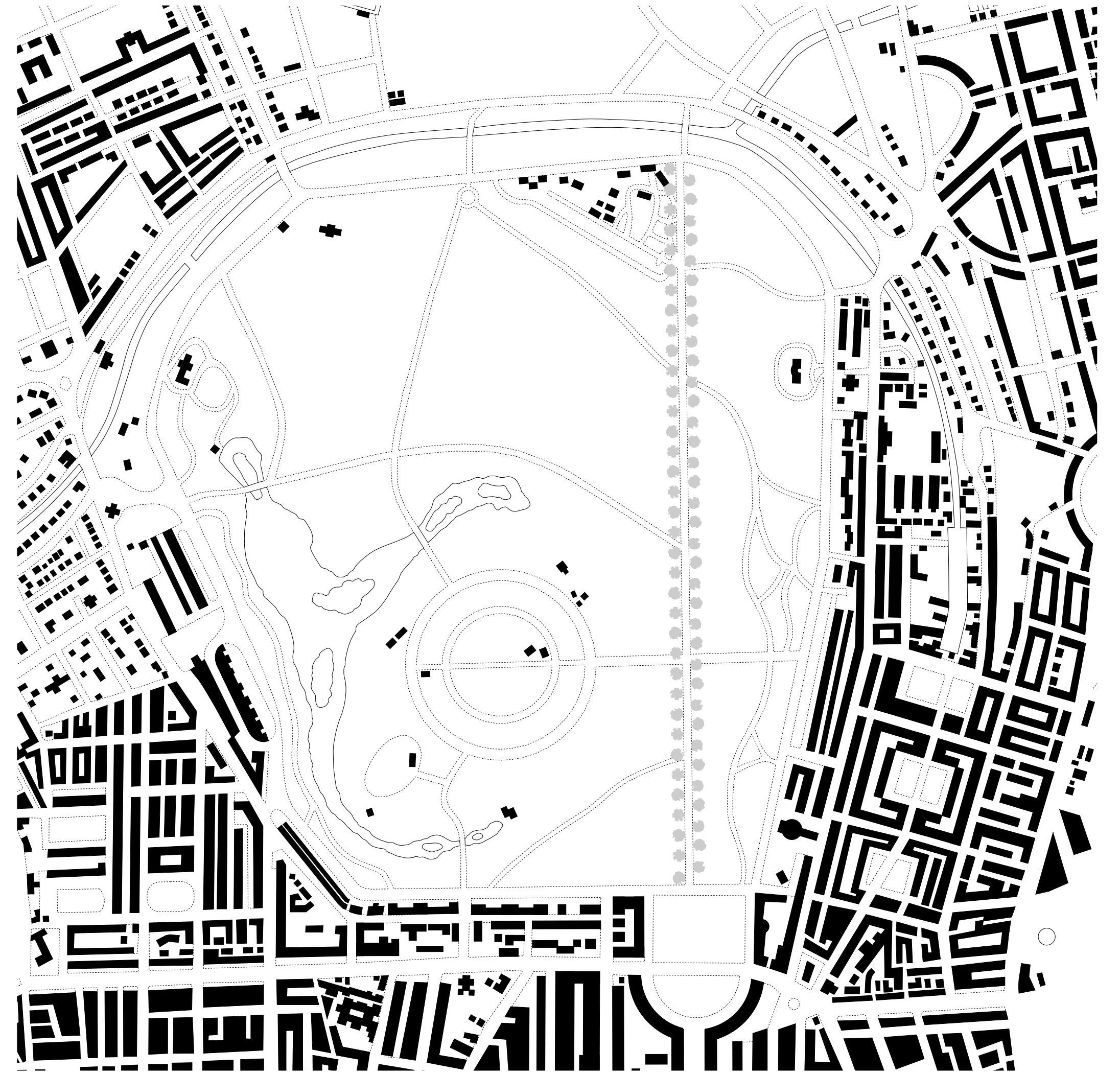
Regents Park, London, England 1843